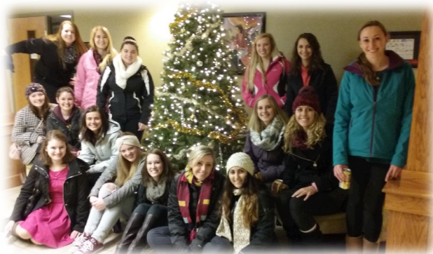
YWCA December 3rd

We had a great year planning all of these events and appreciate all the hard work that the girls put forth to make this year a success! Lambda Delta Sigma, Enter to Learn, Depart to Serve!