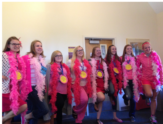
New Actives during Rush