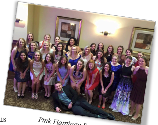
Pink Flamingo Formal

At formal awards were presented to many deserving ladies that were voted on by the society. The awards and recipients are as follows: