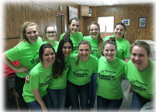
Optional Grandin Ham Dinner March 20th