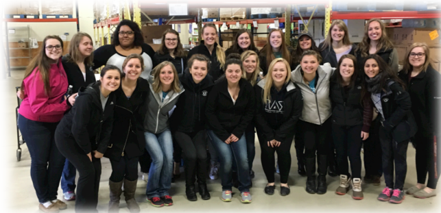
Emergency Food Pantry March 19th